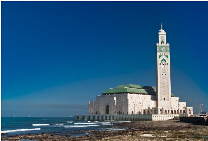
King Hassan II Mosque

Enjoy breakfast in the comfort of your hotel; your day tour begins with King Hassan II Mosque , the largest in Morocco and the third largest in the world, famous for housing the tallest minaret in the world. See the beautiful interior with water features, an amazing roof that opens to the sky and wonderful tile work.